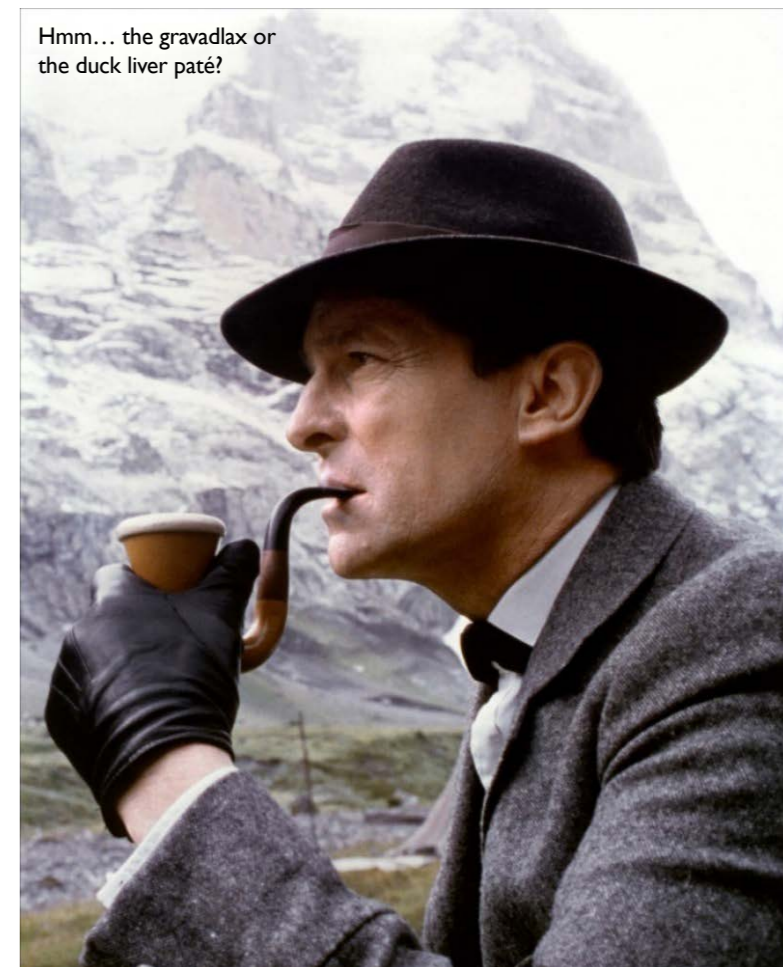
Hmm... the gravadlax or the duck liver paté?

Vintage styling team Lipstick & Curls offer this one-day course, with only 14 places available, which will sell quickly. Contact info@lipstickandcurls.net to book yours (requiring a 50% deposit). Part 1 covers pin curling and the perfect set: pin curls are the basis of every vintage style from the 40s/50s and a great place to start your session. You will be looking at different ways to pin curl the hair, by applying your skills to various hair types and length. Amanda will share her tips and tricks to ensure you understand the importance of this process. The perfect set requires confidence in brushing and styling. Amanda explains the importance of getting this stage right, to be the base for any vintage hairstyle. Part 2 then covers various classic vintage hair-dos, including the victory roll, the poodle and the French pleat. More info