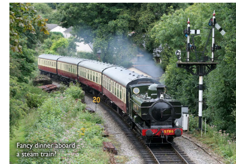
Fancy dinner aboard a steam train?