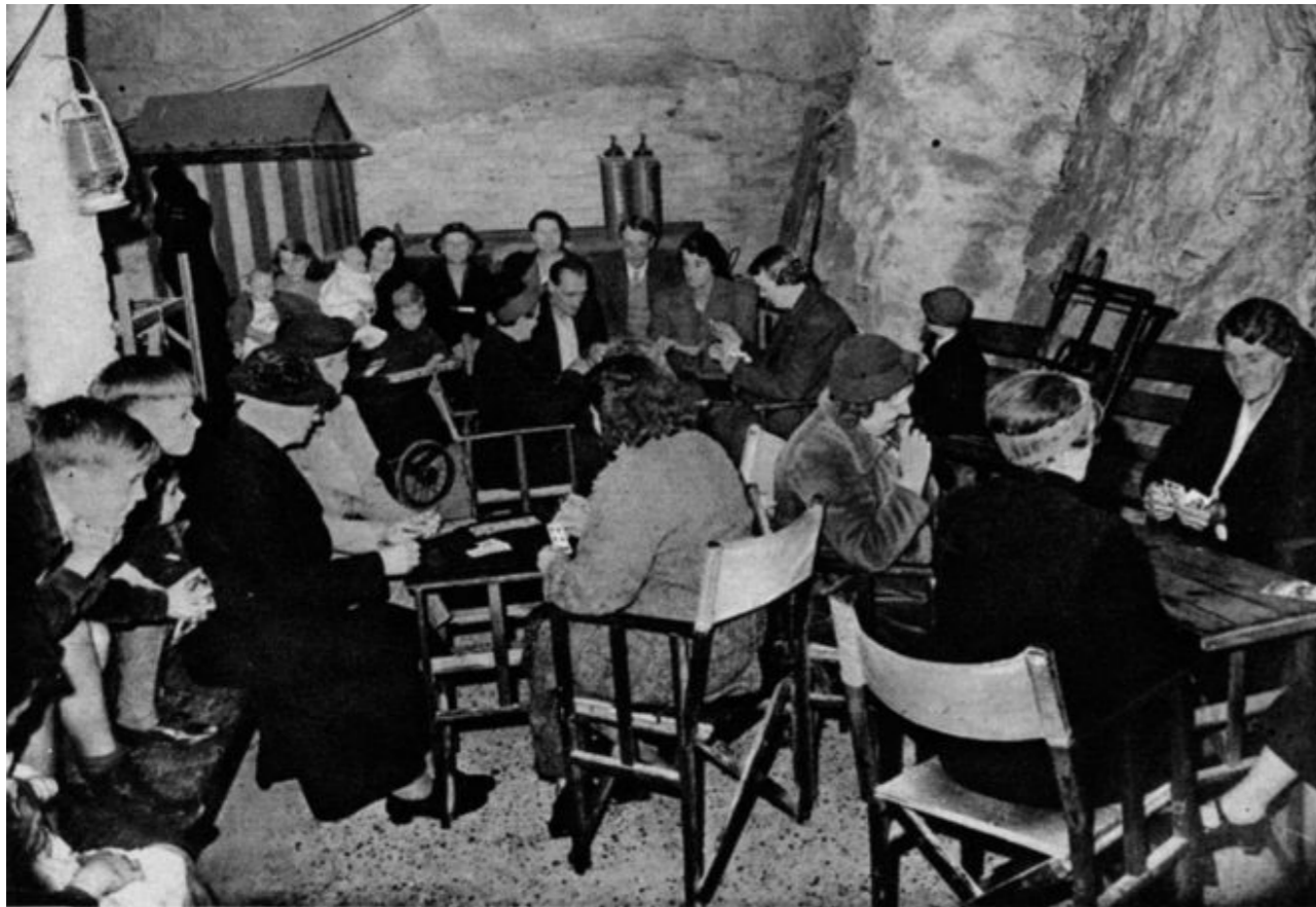
(Above) Citizens pass the time with a whist drive in the caves during the Blitz; (below) the cave system even had its own hospital with seven wards and an isolation unit