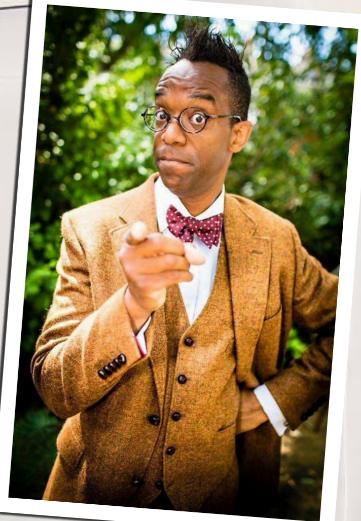
Thank you for allowing yourself to be interviewed in the palatial surroundings of the NSC Club House. On behalf of the Members may I respectfully ask you to resign.

Not done one yet, but keen to get up on stage and seize my moment in the spotlight, I need to first start attending the monthly meet ups.