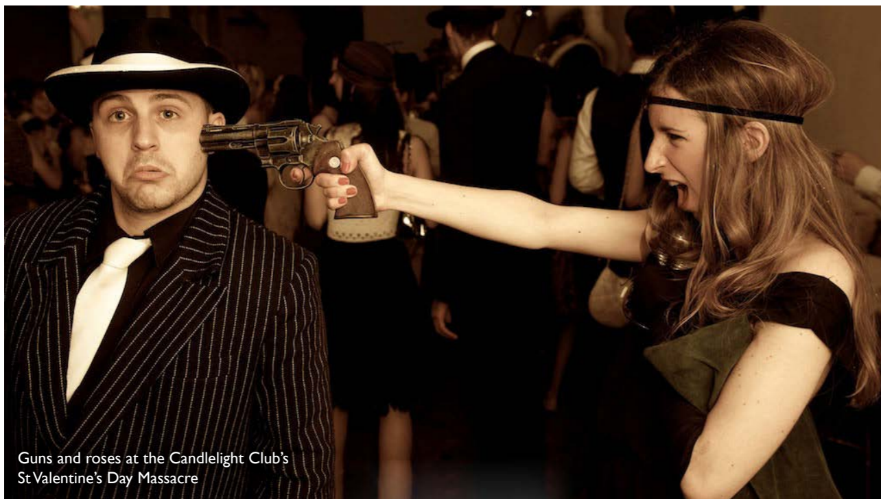
Guns and roses at the Candlelight Club's St Valentine's Day Massacre