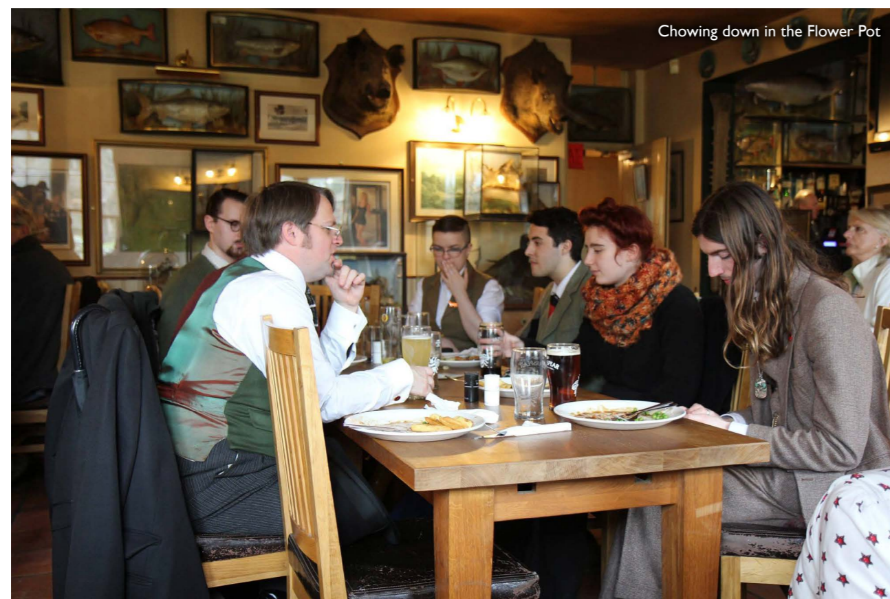
Chowing down in the Flower Pot