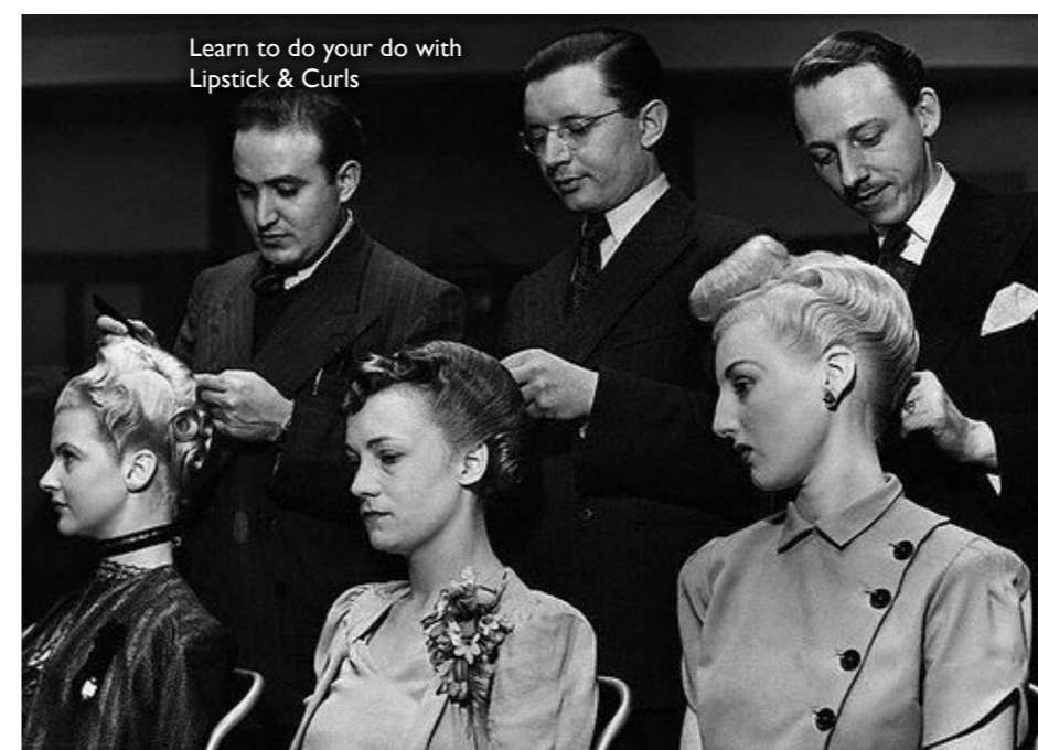
Learn to do your do with Lipstick & Curls

Our own Miss Minna is on the committee for this event, offering a chance to attend a banquet in one of the City's handsome livery halls. The price includes a reception with amuse bouche, a three-course meal with wine, coffee, port and cognac and finally a stirrup cup (more drinks in the Stocks room). It also includes a hefty donation to literacy and educational charities helping children in London. There is entertainment, a parlour game and a prize for best dressed for the theme, although straight-forward black tie is perfectly acceptable. More details here.